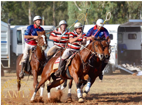
Roma 1 Playing New Zealand