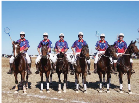
New Zealand Team from Putaruru-Tirau Polocrosse Club