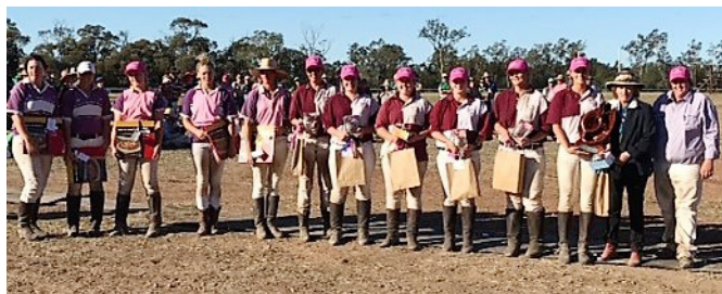
A Grade Sybil Thompson Memorial Trophy Winners