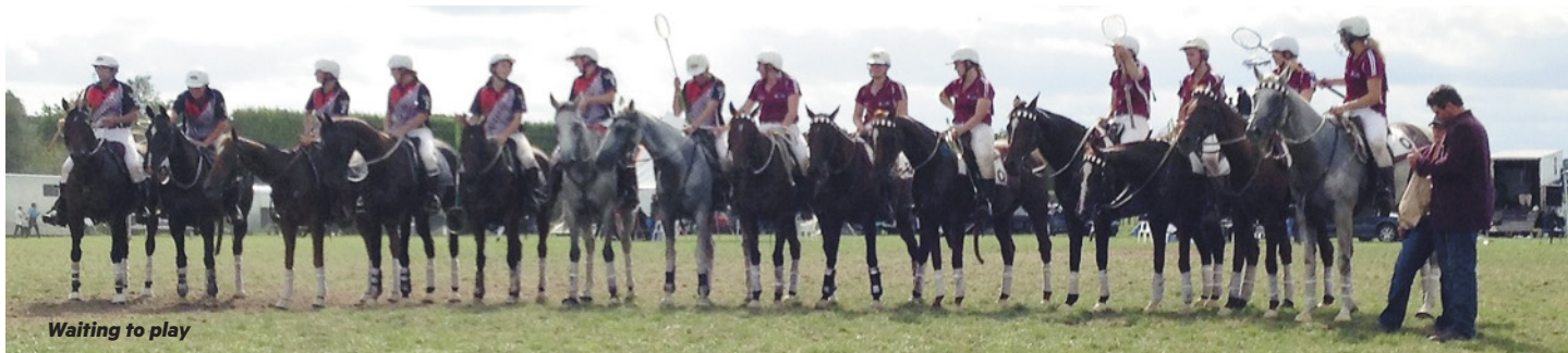
Waiting to play