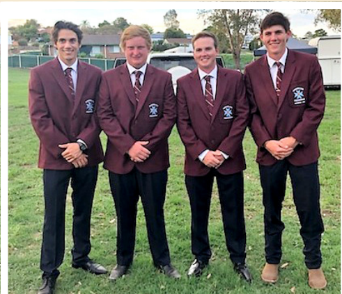
U21 Queensland Boys