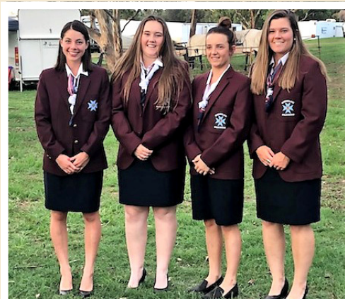
U21 Queensland Girls