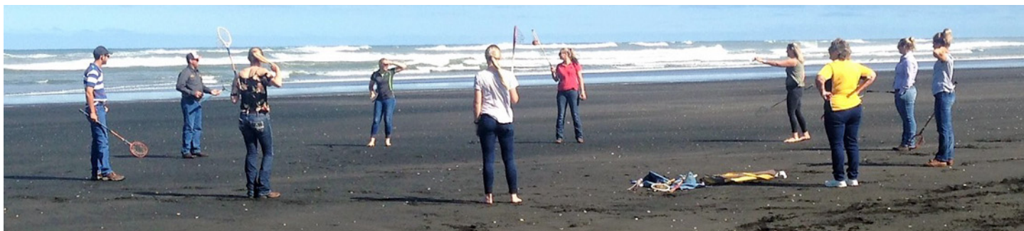
Practice on the beach in New Zealand