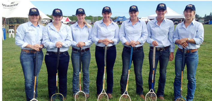
Coopers Cup Team